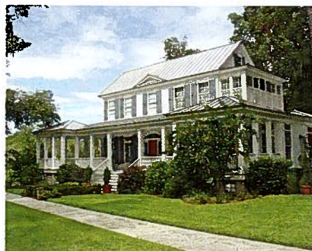
Next page, surrounded by azaleas, the post office at Habersham is part of the community's town center.