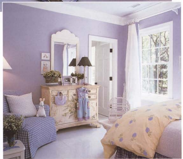
Wispy lavender, yellows, and whites define the palette in the girl's room, while bolder primary colors define the boy's room. Plantation shutters adorn the wall of windows in the boy's room. • Paint: Ace Hardware/Royal Paints; Plantation shutters: Hunter Douglas Window Fashions.

White painted floors throughout the upstairs tie together all three bedrooms.